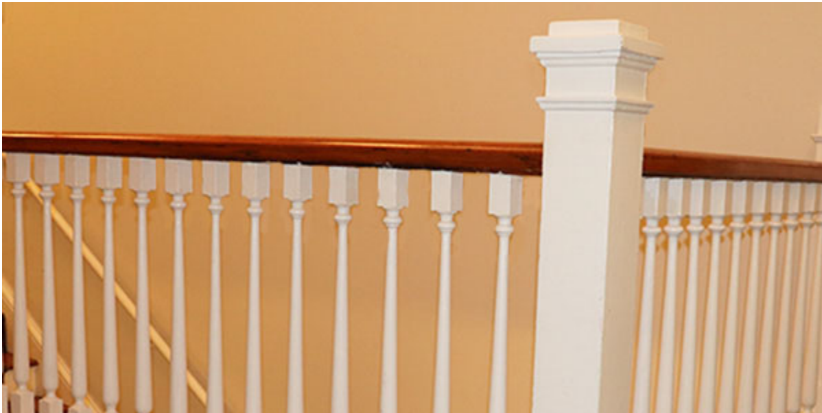
Meigs Hall interior stairwell

Dear IHE graduates and friends, Several of you have shared exciting news lately. I can feel momentum building as we head into summer.